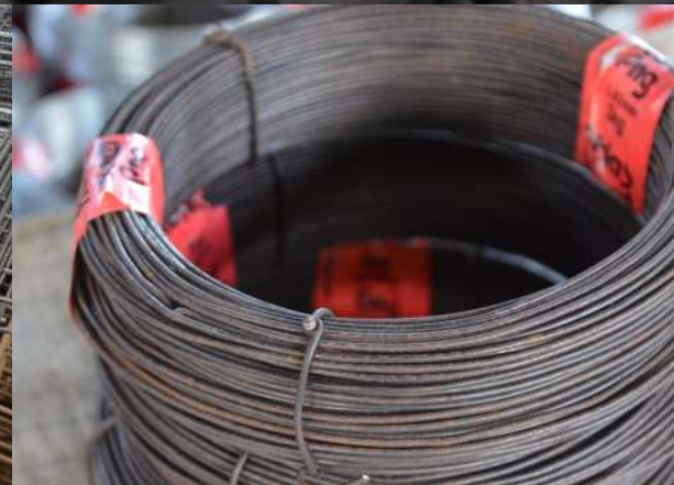
Black Tie Wire