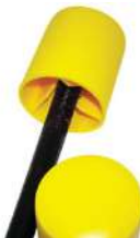
Bar Guards Yellow Plastic