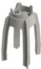
Plastic Chair for Top Steel