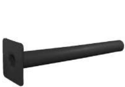
Dowel Speed Sleeve Nailing Plate

Concrete jobs require a variety of accessories including combination mesh chairs, spacers, bar guards, tie wire and additional building accessories. We can help you choose the most effective products for your application.