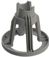
Slab on Ground Spacers