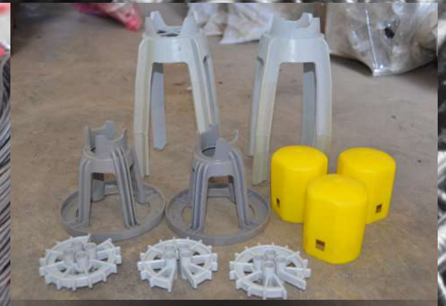
Reinforcing Bar Accessories