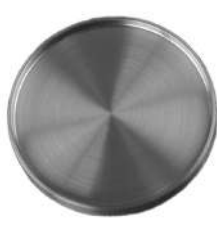
Metal Base Plate